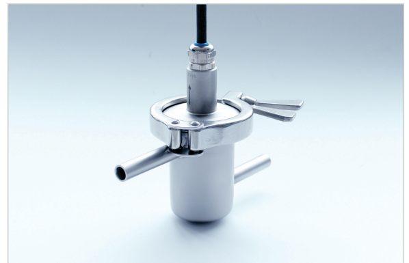
Sensor integration in the flow adapter